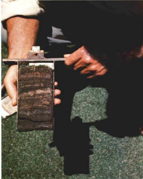
Several layers, created by topdressing with different materials, represent different management programs over the years.

Roots - Root development can be observed by lifting away the soil with the point of a knife. Check for white, healthy roots and rhizomes. Use a Macroscopic or a high-powered magnifying glass to observe the all-important root hairs. Another method is to soak the entire profile in a shallow pan of water and gradually wash away the soil until the roots are exposed. Record