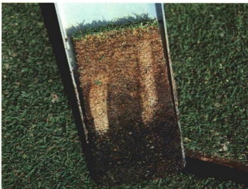
Soil drainage can be altered by manipulating the soil through hollow-tine aerification, and backfilling with a desirable topdressing mixture.

It appears that some of the most damaging layers are those that consist of heavy topdressing over thatch and